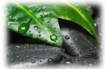
Topflight tests confirmed that our labels are both water-proof and durable.