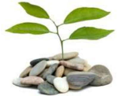
High performance eco-paper can be recycled with traditional paper or plastic.